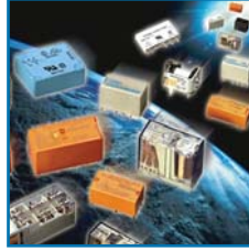
Schrack PCB Relays