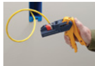
5. Pull trigger completely and remove excess wire prior to releasing trigger.