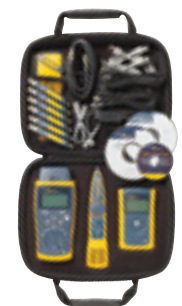
CableIQ Gigabit Service Kit