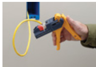
4. Ensure jack is completely and securely inserted in jack holder bed with IDC slots facing the blades.