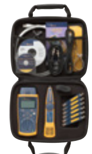
CableIQ Advanced IT Kit

CableIQ Gigabit Service Kit combines powerful Gigabit cable and network testing. Expedites problem resolution and facilitates moves, adds, changes, and upgrades. Documents cabling bandwidth and network link speed.