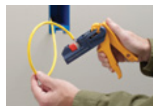
3. Insert jack in JackRapid front first with IDC slots facing blades of JackRapid.