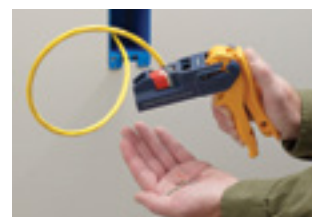
6. Wires will be seated and cut for a solid termination.