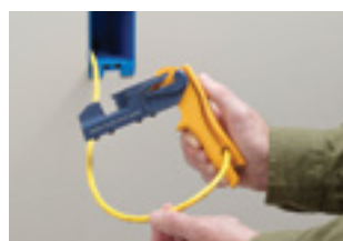
1. Strip cable jacket with a standard cable stripper or the built-in cable stripper.

Get accurate terminations and clean, consistent cuts every time with the JackRapid Termination Tool.