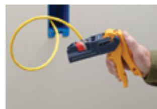
5. Pull trigger completely and remove excess wire prior to releasing trigger.