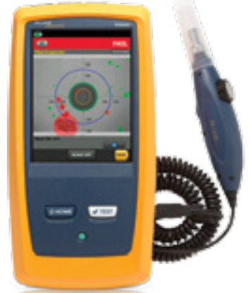
More on page 28