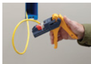
4. Ensure jack is completely and securely inserted in jack holder bed with IDC slots facing the blades.