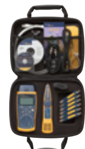
CableIQ Advanced IT Kit

CableIQ Gigabit Service Kit combines powerful Gigabit cable and network testing. Expedites problem resolution and facilitates moves, adds, changes, and upgrades. Documents cabling bandwidth and network link speed.