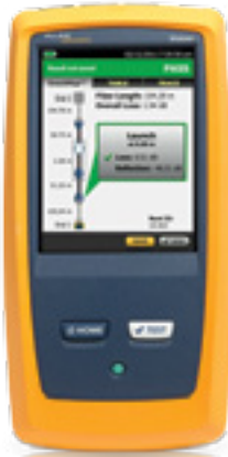
More on page 20