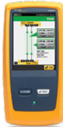
More on page 21