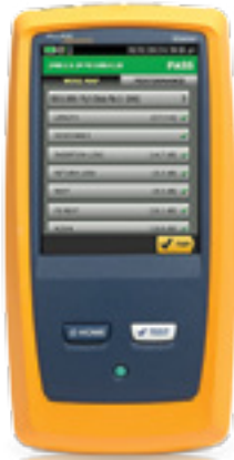
More on page 5

Faster systems acceptance for all copper and fiber certification jobs.