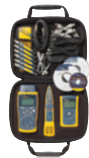
CableIQ Gigabit Service Kit