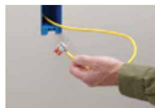
2. Determine wiring scheme. Dress all four pairs (eight wires).