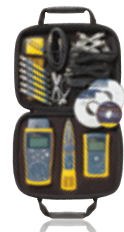
CableIQ Gigabit Service Kit