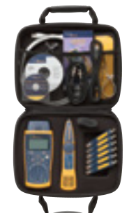
CableIQ Advanced IT Kit

CableIQ Gigabit Service Kit combines powerful Gigabit cable and network testing. Expedites problem resolution and facilitates moves, adds, changes, and upgrades. Documents cabling bandwidth and network link speed.