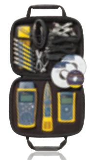
CableIQ Gigabit Service Kit