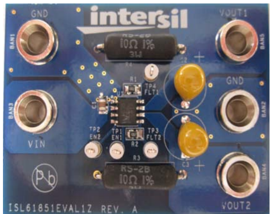
FIGURE 32B. ISL61851EVAL1Z BOARD PHOTO