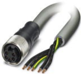
Power cable, 5-pos., gray PVC, 2.5 mm 2 , free cable end to straight 7/8" 16UNF socket, length: 10.0 m

Please be informed that the data shown in this PDF Document is generated from our Online Catalog. Please find the complete data in the user's documentation. Our General Terms of Use for Downloads are valid ( http://download.phoenixcontact.com )