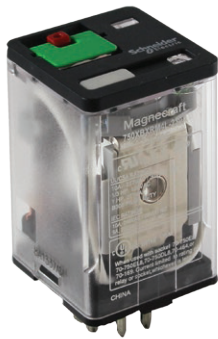
750 Full-Feature Cover