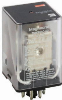
750 Clear Cover

The 750 series octal base, plug-in relays offer clear or full-feature covers with multiple mounting options and accessories.