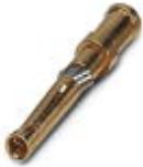
Turned 1.6 crimp contact, individual female contact, core diameter 2.5 mm 2 , gold-plated

Crimp contact - CK1,6-ED-2,50BU AU - 1674985