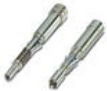
Fiber optic pin contact POF, turned, for contact carriers of CK1,6-ED... contacts

Female contact - CK1,6-ED-BU-POF - 1885004