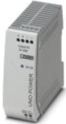
Primary-switched UNO power supply for DIN rail mounting, input: single-phase, output: 5 V DC/40 W

Please be informed that the data shown in this PDF Document is generated from our Online Catalog. Please find the complete data in the user's documentation. Our General Terms of Use for Downloads are valid ( http://phoenixcontact.com/download )