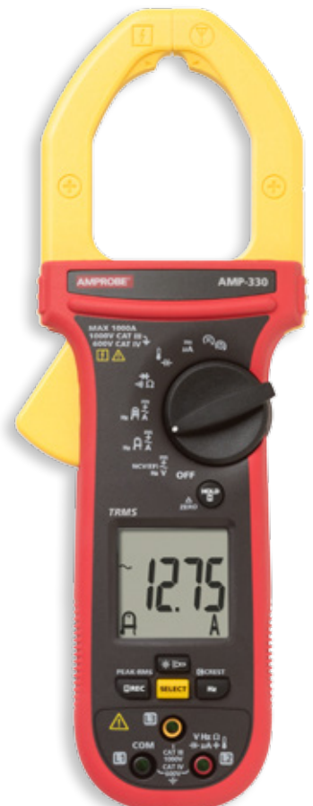
AMP-330 AC/DC 1000 A Clamp Meter Industrial Motor Maintenance