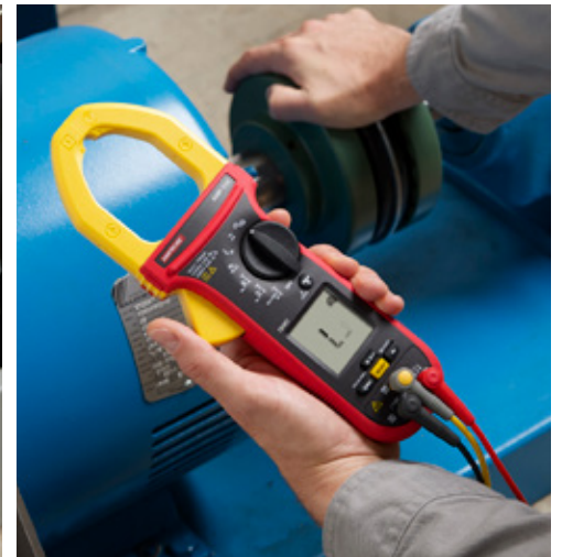
AMP-330 AC/DC 1000 A Clamp Meter Industrial Motor Maintenance