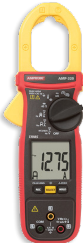
AMP-320 AC/DC Clamp Meter Electrical Motor Maintenance