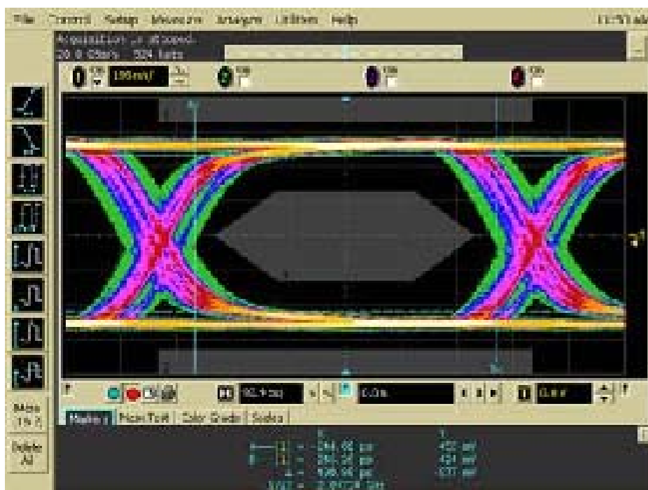
Figure 6: 8bit deep color DVI/HDMI TX eye tested with 25 meter. 24 AWG HDMI cable. Setting: Optimized equalization, 0dB output pre-emphasis and de-emphasis, and Swing 500mV.