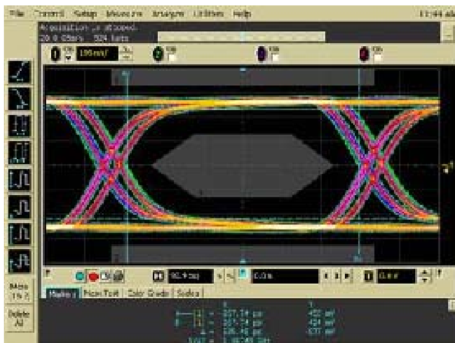
Figure 3: 8bit deep color DVI/HDMI TX eye tested with 2 meter. 30 AWG HDMI cable. Setting: Optimized equalization, 0dB output pre-emphasis and de-emphasis, and Swing 500mV.