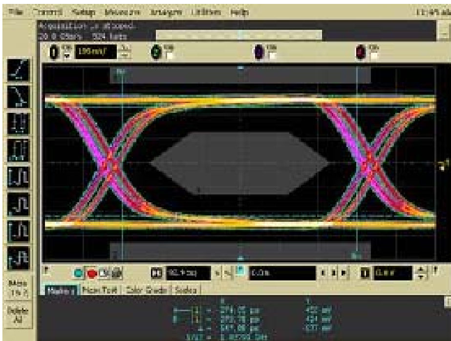
Figure 4: 8bit deep color DVI/HDMI TX eye tested with 10 meter. 24 AWG HDMI cable. Setting: Optimized equalization, 0dB output pre-emphasis and de-emphasis, and Swing 500mV.