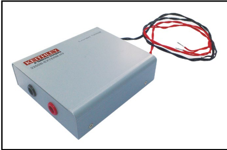
Model 2260B-EXTERM-HV: Extended terminal for 250V and 800V models; test leads and terminal box to bring outputs to the front of the instrument or another location. Magnetic base attached to side of instrument.