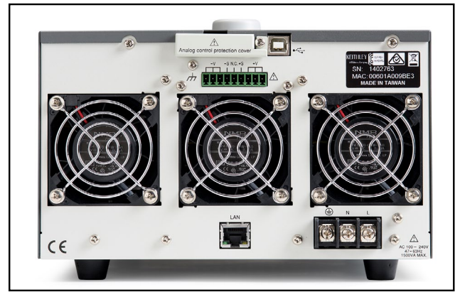
Rear panel of 1080W models.