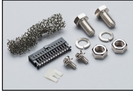
Model 2260-004: Accessory Kit (30V and 80V models): Air filter, analog connector cover, analog control lock lever, M8-size output terminal bolts, washers and screws, and M4-size output terminal screws with washers.