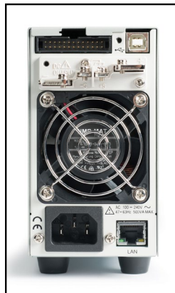
Rear panel of 360W models.

* Replace the specific power supply model number in place of Model Number to generate the appropriate model number for a service item. For example, for Model 2260B-30-36, a 1-year extended warranty model number would be 2260B-30-36-1-EW.