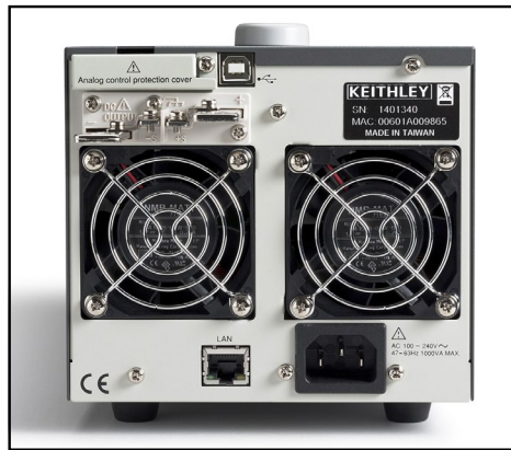
Rear panel of 720W models.