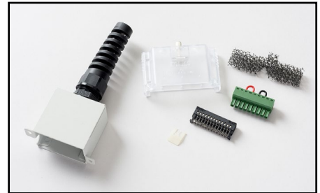
Model 2260-010: Basic Accessories Kit (250V and 800V models): Air filter, analog protection cover, analog control lock lever, output terminal cover, output terminal connector, strain relief.