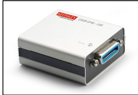
Model 2260B-GPIB-USB Adapter: Provides a GPIB interface for the Series 2260B power supplies.