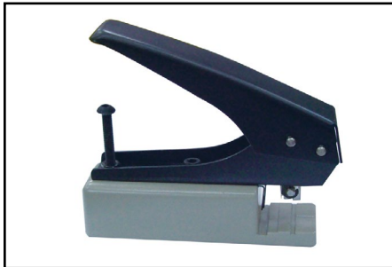
Model 2260-002: Simple IDC tool.