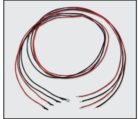
Model 2260-009: Test Lead Set for 250V and 800V models, two sets of red and black wires, 20AWG, 1.22m (48 in), stripped wires on one end and lugs on the other end.