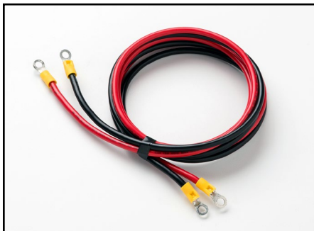
Model 2260-008: Test lead set with lugs, 10AWG, 1.22m (48 in), red/blue wire pair with #10 terminal lugs on each end.