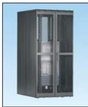
Net-Access™ 7018 Cabinets