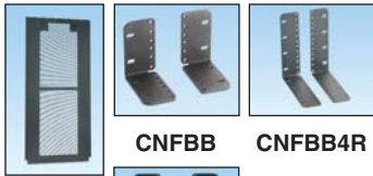
CNPP CNFBB CNFBB4R