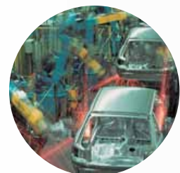
Vehicle manufacturing equipment