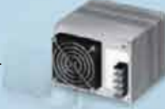
Standard Power Supply with Fan

Fan replacement every 2 to 3 years Dust drawn in by fan