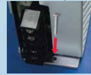
Screw Mounting from Top

Compact right-angle mounting bracket enclosed for easy mounting.