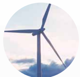
Wind power generation