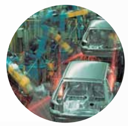
Vehicle manufacturing equipment