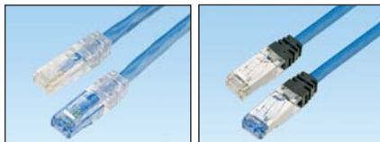
Keyed UTP Copper Patch Cords