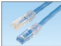
Keyed UTP Copper Patch Cords