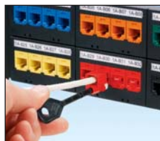
PSL-DCPLX, PSL-DCPLRX, and PSL-DCPLS