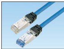
Keyed Shielded Copper Patch Cords