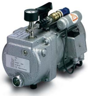
CMS-VAC-W5 Vacuum Aggregate