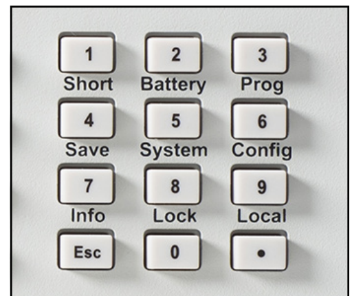
Figure 1. Use either the rotary knob or the keypad to quickly enter settings and set parameter values using all the available resolution.