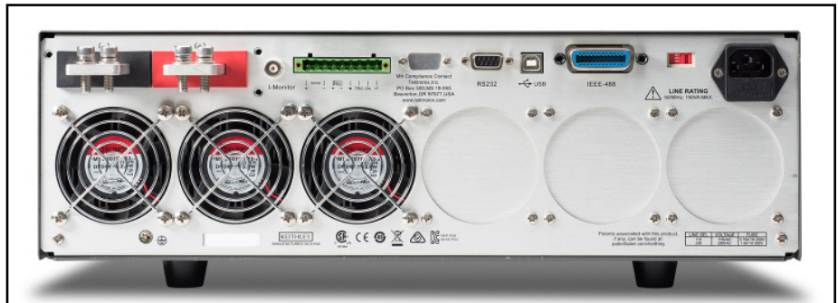
Model 2380-500-30 rear panel