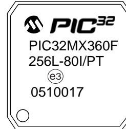
64-Lead QFN (9x9x0.9 mm)