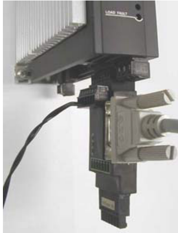
FIG. 1 THYRO-S

The connection of the interface at Thyro-S corresponds to fig. 1. Then the free upper 7-pin row is intended for the plug that was before on the connection present (set point wiring). The plug is to put directly below the Thyro-S from left side on to the interface.