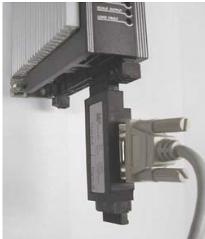
FIG. 2 THYRO-A 1A