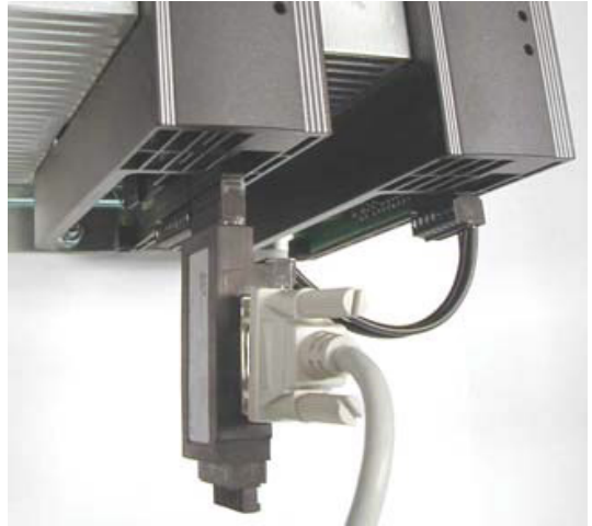
FIG. 3 THYRO-A 2A