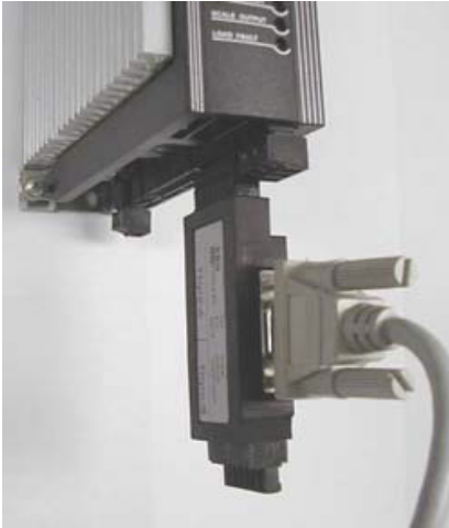
FIG. 2 THYRO-A 1A