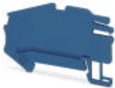
Support bracket, Bracket for busbars, set every 20 cm, Length: 67 mm, Width: 2 mm, Height: 43 mm, Color: blue