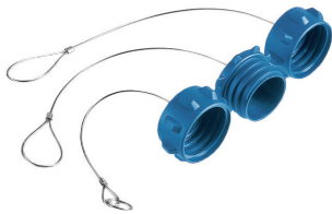
PX0990, PX0991, PX0992