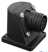
PX0950 & PX0941