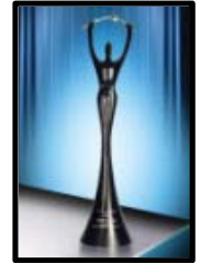
Electra Award 2005