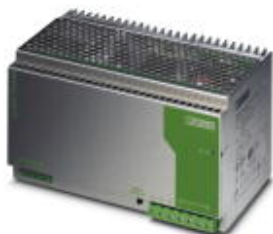
DIN rail power supply unit 24 V DC/40 A, primary switched-mode, 3-phase.

Please be informed that the data shown in this PDF Document is generated from our Online Catalog. Please find the complete data in the user's documentation. Our General Terms of Use for Downloads are valid ( http://phoenixcontact.com/download )