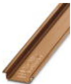
DIN rail, material: Copper, unperforated, height 7.5 mm, width 35 mm, length: 2 m

DIN rail - NS 35/ 7,5 CU UNPERF 2000MM - 0801762