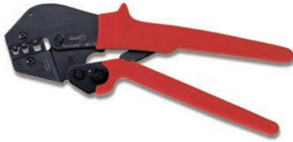
Ratcheted Hand Tool

A range of single action, factory calibrated tools are available to support the stamped contacts and 30 A power contacts.