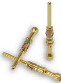
Size 16 AWG, No Insulation Grip