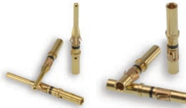
Size 16 AWG, No Insulation Grip