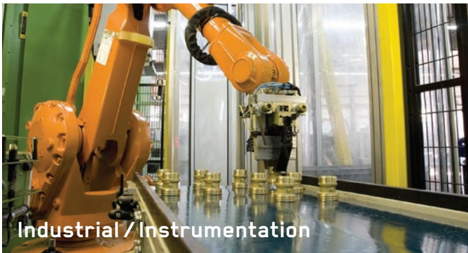
Industrial / Instrumentation