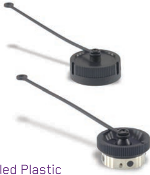
Plug Dust Cap