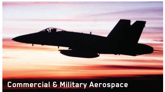
Commercial & Military Aerospace

Our connector portfolio remains the most extensive in the industry.