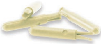
Discriminating Pin Insertion