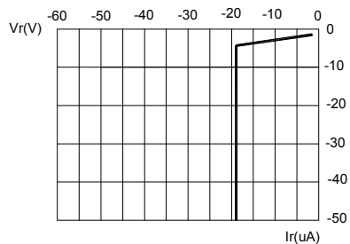
FIG.3a BLUE & GREEN REVERSE CURRENT VS. REVERSE VOLTAGE.