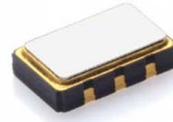
Part Dimensions: 5.0 x 3.2 x 1.3mm • 58.1mg