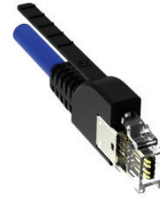
With Pull Tab PNs 2100356/357 PNs 2142758/759