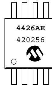
8-Lead PDIP (300 mil)