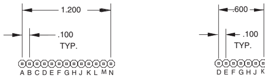
SINGLE POLE COMMON BUS TERMINAL MATRIX TERMINAL PIN-OUT