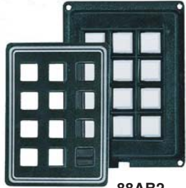
88-101 88AB2, 88AC2