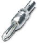
Test plugs, Color: silver