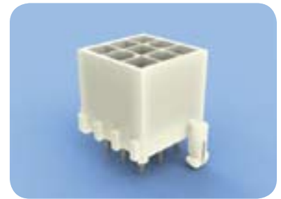
Vertical Pin Header