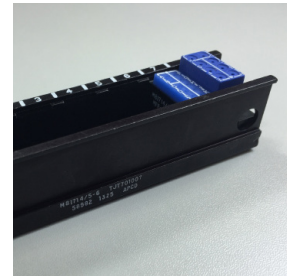
Feedback, Feedthrough & Bussing Modules