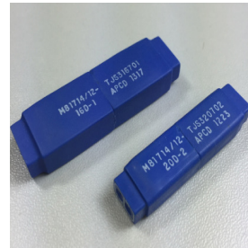
Single In-Line Splices Dual In-Line Splices Electronic Splices