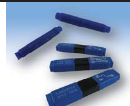
Single In-Line Splices Dual In-Line Splices Electronic Splices