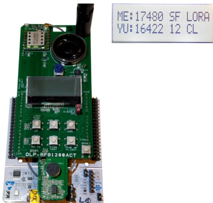
DLP-RFS1280ACT DEMONSTRATION PLATFORM (Serving as a Target for this demonstration)

The system is set up and ready for this demonstration once all Target transceivers are powered and set to LORA Mode. If a Target is set to GFSK or FLRC Mode, simply press Button 1 until “LORA” is shown in the display: