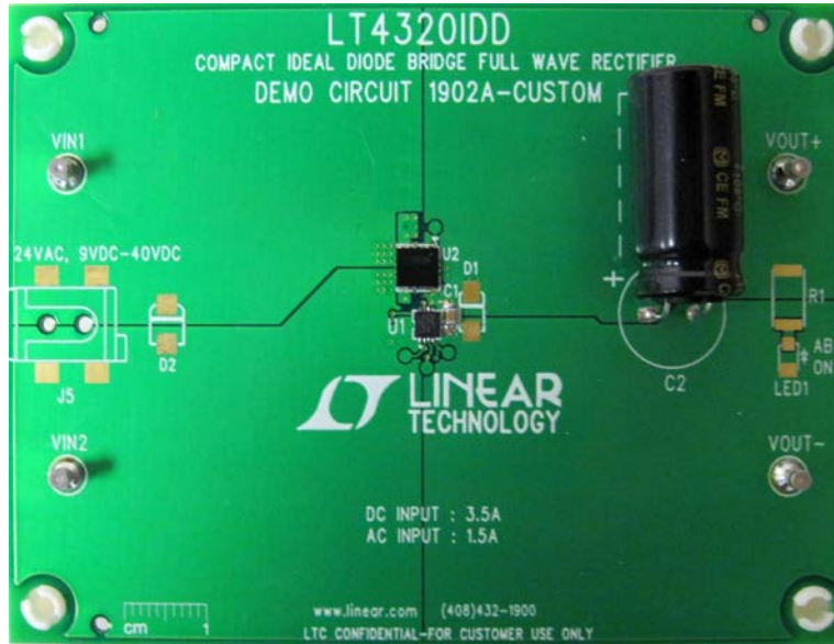
Figure 4. Demonstration Circuit 1902A Used in Figure 3 Thermograph