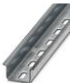
DIN rail, material: Galvanized, perforated, height 15 mm, width 35 mm, length: 2 m

DIN rail - NS 35/15 ZN PERF 2000MM - 1206599