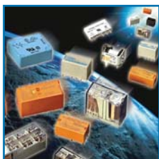
Schrack PCB Relays