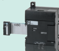
CP1W-SRT21 Inputs: 8 bits Outputs: 8 bits