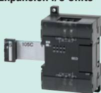
CP1W-8ED DC inputs: 8