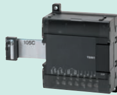
CP1W-TS001 Thermocouple inputs: 2 CP1W-TS002 Thermocouple inputs: 4 CP1W-TS101 Platinum-resistance thermometer inputs: 2 CP1W-TS102 Platinum-resistance thermometer inputs: 4