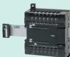
CP1W-16ER Relay outputs: 16