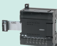
Analog Input Unit CP1W-AD041 Analog inputs: 4 (resolution: 6,000)