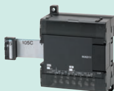
Analog I/O Unit CP1W-MAD11 Analog inputs: 2 (resolution: 6,000) Analog outputs: 1 (resolution: 6,000)