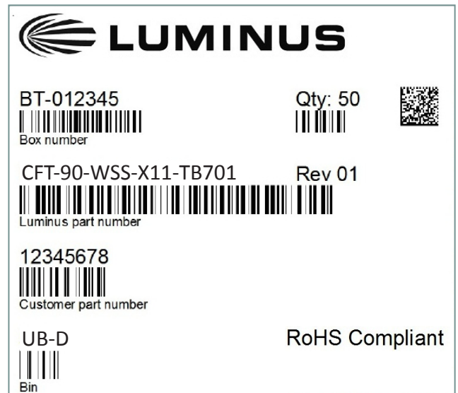
Sample label –for illustration only