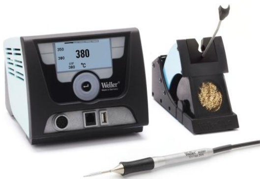
WX 1 control unit with WXMP Micro soldering pencil (40W / 12V) and WDH 50 safety rest