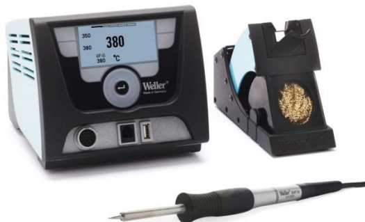
WX 1 control unit with WXP 65 soldering pencil (65W / 24V) and WDH 50 safety rest