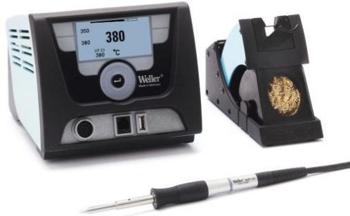
WX 1 control unit with WXP 120 (120 W / 24 V) soldering pencil and WDH 10 safety rest